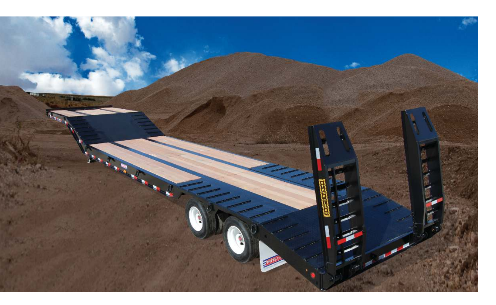
You're Ahead With A Pitts Behind™