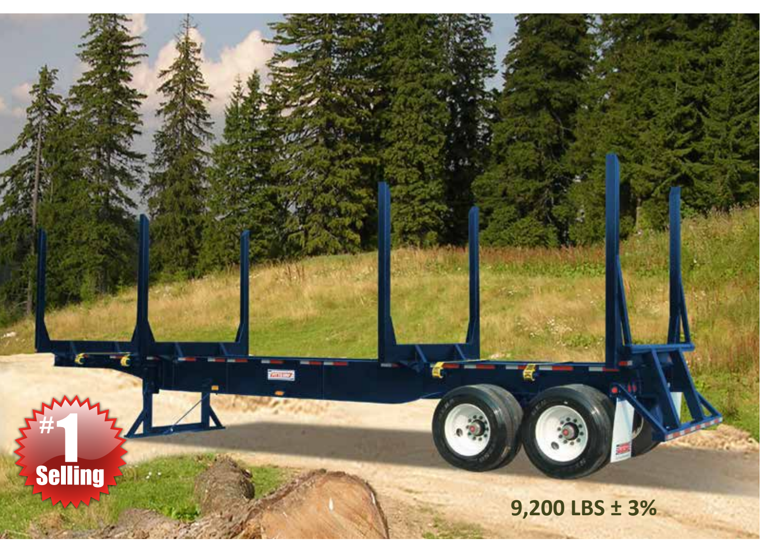
"You're Ahead With A Pitts Behind"