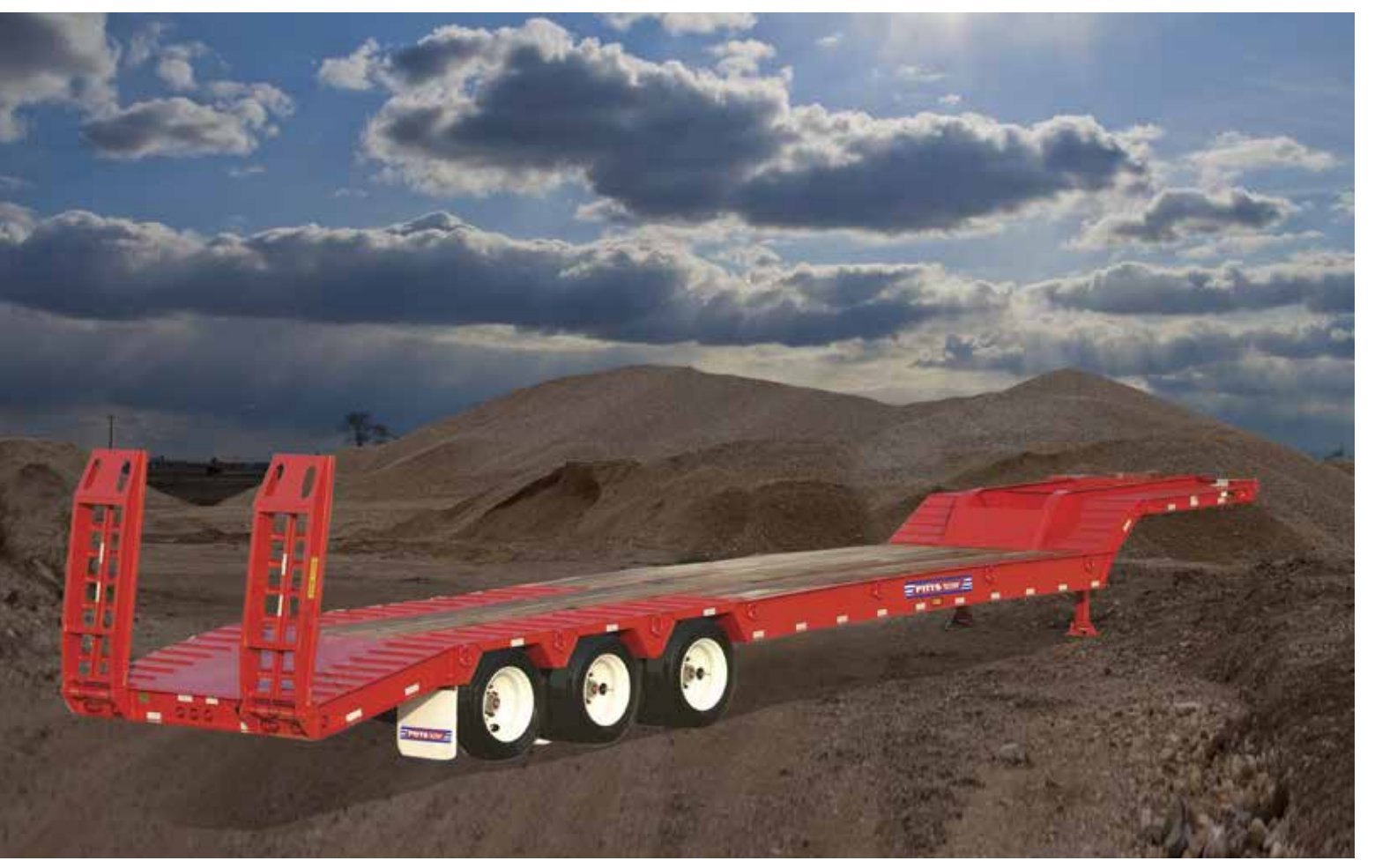
"You're Ahead With A Pitts Behind"