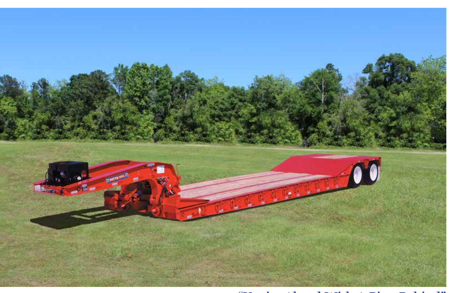
"You're Ahead With A Pitts Behind"